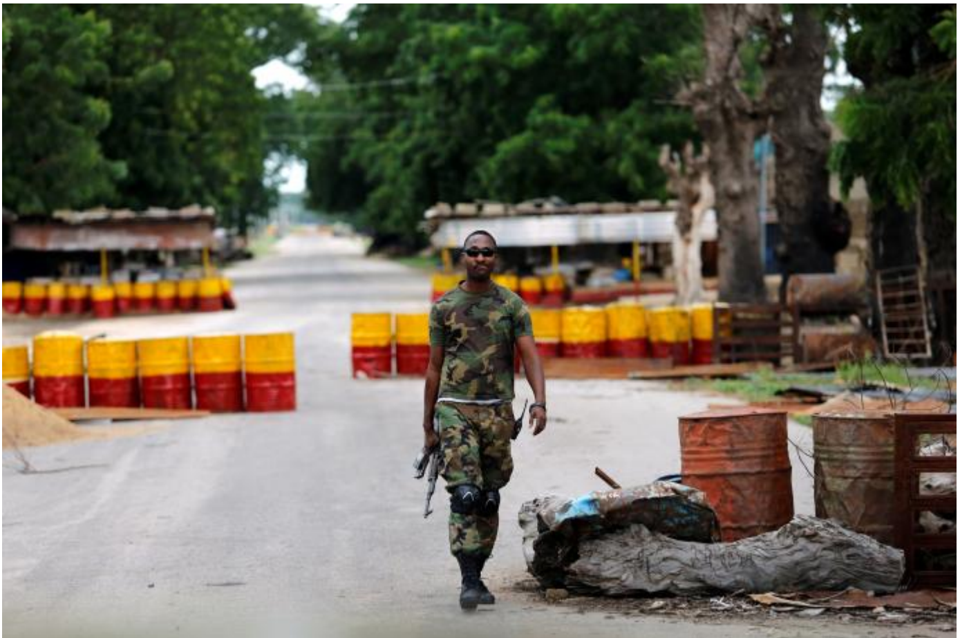
A soldier walks past a checkpoint in Bama, Borno State, Nigeria, August 2016.