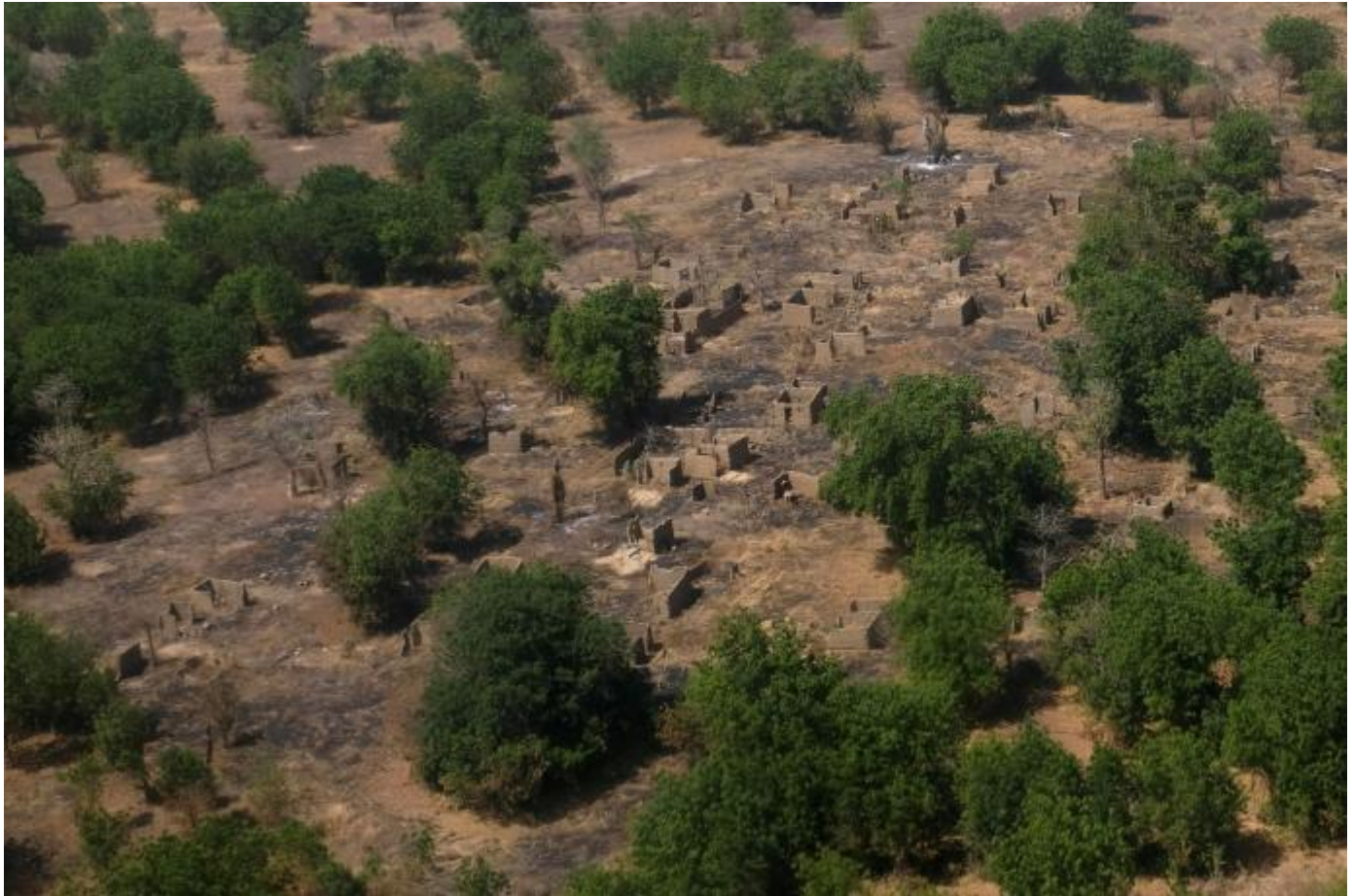
An aerial view of buildings standing on scorched ground that have been destroyed in the conflict with Boko Haram in the Bama region of Borno state, Nigeria, November 2017.